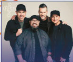
BIG DADDY WEAVE